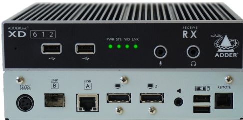
ADDERLink XD612 RX - Front & Rear

CAT6 is recommended for CATx extensions. CATx extensions are limited to 2 short patch connections. Patch cables should be CAT6 or better.