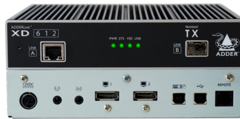
ADDERLink XD612 TX - Front & Rear