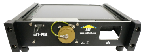
AIT-PDL with ARINC Standard 53-pin Connector